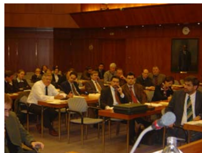
An Impression of the Audience